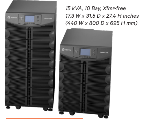
15 kVA, 10 Bay, Xfmr-free 17.3 W x 31.5 D x 27.4 H inches (440 W x 800 D x 695 H mm)