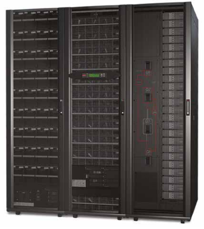
Symmetra PX 100 with 100 kVA modular PDU