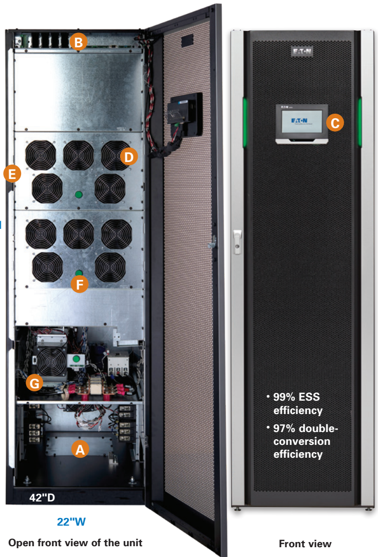
Open front view of the unit